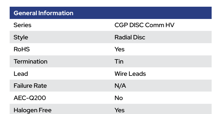
Click here for the 3D model.