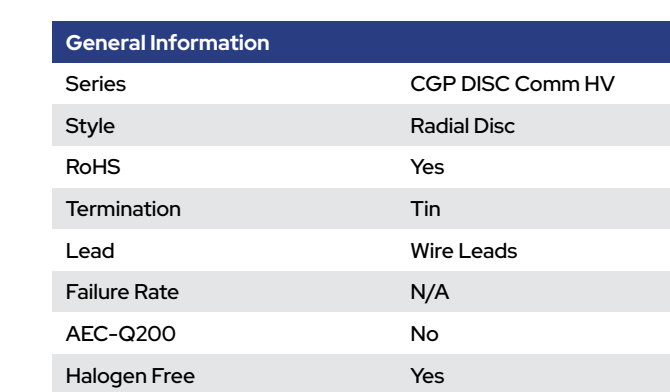
Click here for the 3D model.