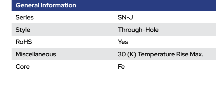
Click here for the 3D model.