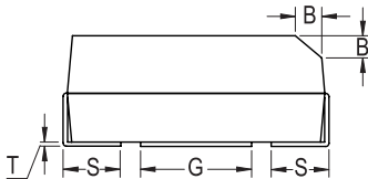
ANODE (+) END VIEW